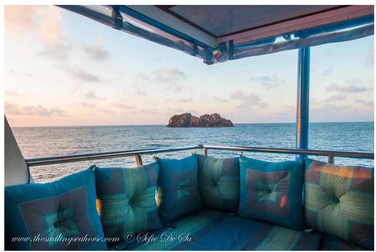
A large sofa area at the back of the upper deck.