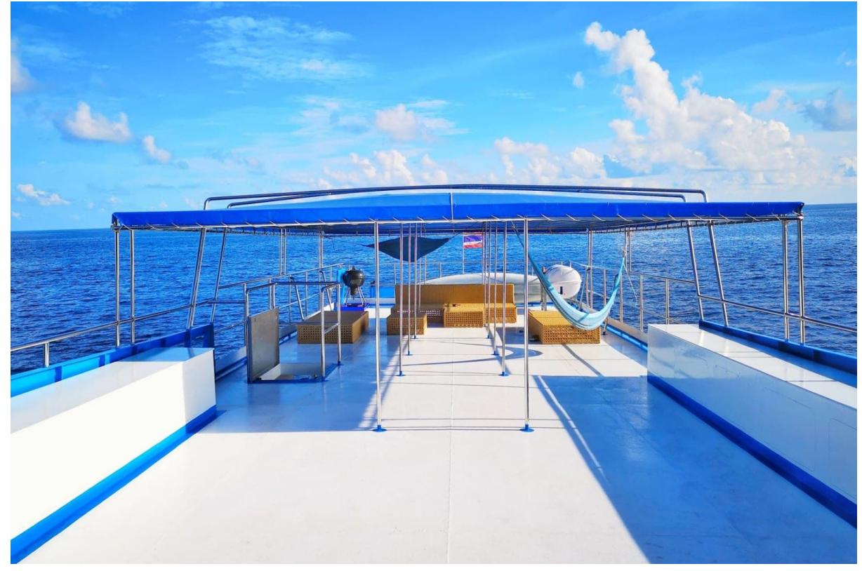
Hammocks, sofas and loungers for all.